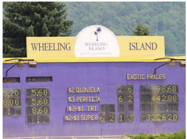
A DAY AT THE RACES: The Wheeling Island Race Track