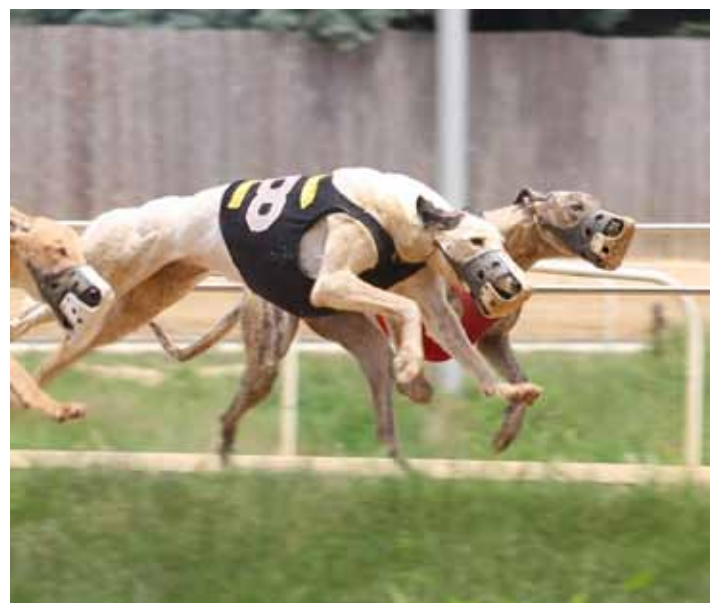
HERE COMES LUCKY: One of the races we watched.