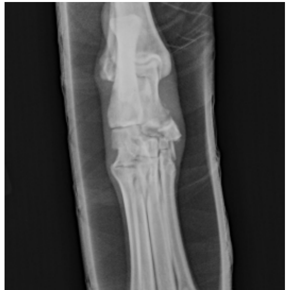
TAKING A BREAK: Red (Top) and his luxated tarsal bone (middle and bottom).

mentioned that whatever GAL foster home works with Red is going to have an extremely difficult time letting him go. Red is that special.