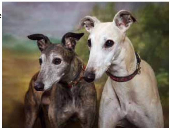
Sandy and Ox Forman are ambassadogs.

Our first “venue” is Lord of Life Adult Day Health Center located in Depew, NY which provides day care services for stroke recovery individuals, head trauma victims and frail elderly dementia clients. Volunteers from our program will be making a monthly visit on the second Wednesday of each month from 1:00 pm - 2:00 pm. I attended this facility with my two hounds, Bo & Marti on October 21st. The clients of the facility absolutely loved seeing and petting the dogs, some hugged them; yet others just stared with a far away look on their face as if they were remembering from a long, long time ago. The more able clients asked questions about the breed and owning them. Some of them told stories of their dogs from days