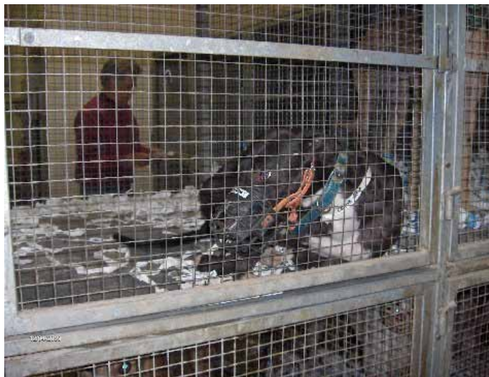
LUCKY CHARM- Charm awaits transport from Dairyland on December 5. He is currently in foster care.

The cash offer to each kennel operator - there are twelve kennels at the Kenosha track housing hundreds of dogs - was made after negotiations between track owners and state regulators. The dogs must be moved out by February 5.