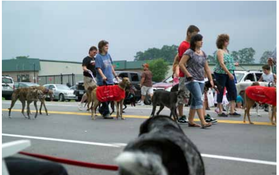
GREY SKIES, GREYHOUNDS: Marchers at the Corn Festival Parade in Eden.