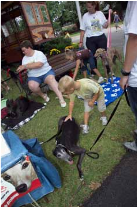
FAIR PLAY: Greys and their people, working the Erie County Fair crowd.

Nail Trimming Fundraiser – another successful fundraiser hosted by the GALs. This is a popular venue and we look forward to our next opportunity thanks to Stapley Feeds.