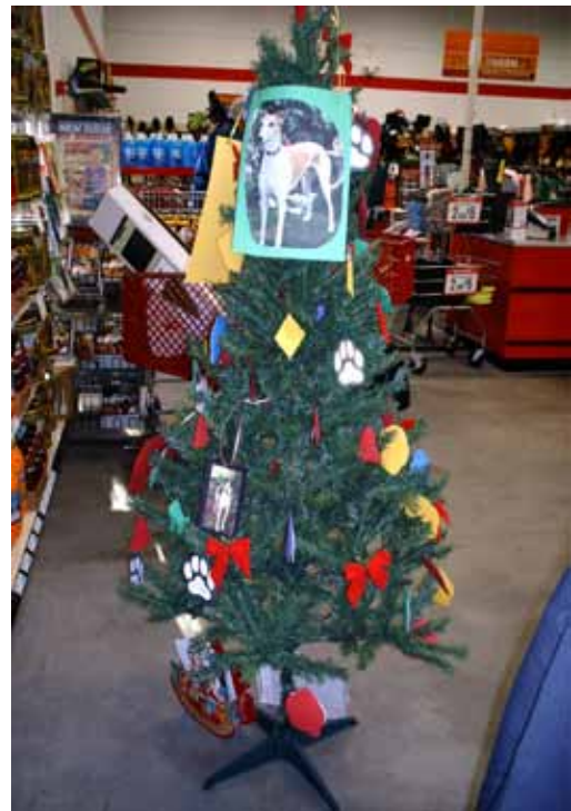
THE GIVING TREE: Tractor Supply of Hamburg graciously allowed the space for this greyhound themed gift tree.